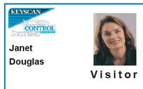
Visitor Badge Example